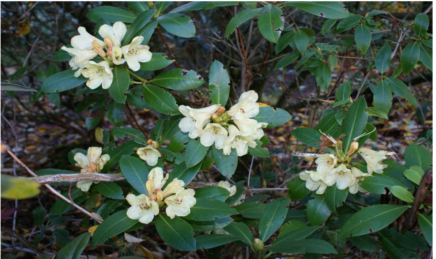
Glendoick Gold (according to the tag)